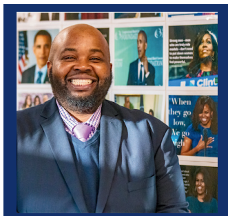
Rodney Robinson 2019 National Teacher of the Year

Rodney will define what equity means in education today. He will give concrete examples of inequities and how educators can play a solid role in ensuring all students receive an equitable education. Participants will leave speech energized with practical solutions to help end education inequities.